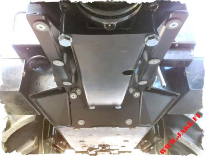
Without JAKE Engine Armour